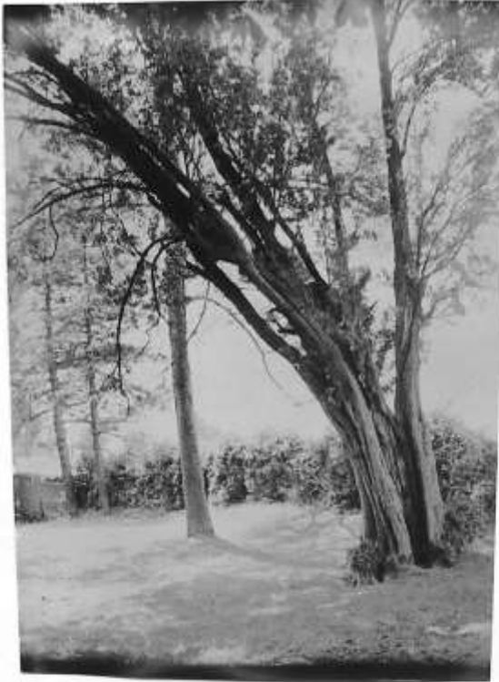
The old Thorn tree, 1901, Marstow near Ross at the corner of the cross roads

In the Club library is an album with photographs seemingly dating from late 19th century. One shows an ancient thorn tree, often cited as boundary trees despite their apparent shorter lifespan. The tree must have been thought as significant, perhaps because the farm nearby is called 'The Thorn'.