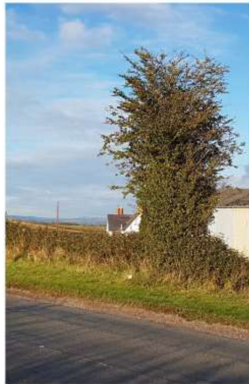
A hawthorn tree in about the same position as the one in the photograph. The Thorn farmhouse is just visible