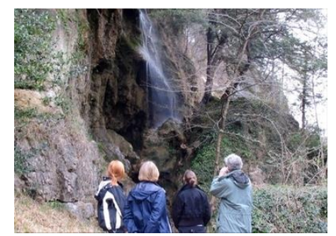
The Dripping Well on the Great Doward