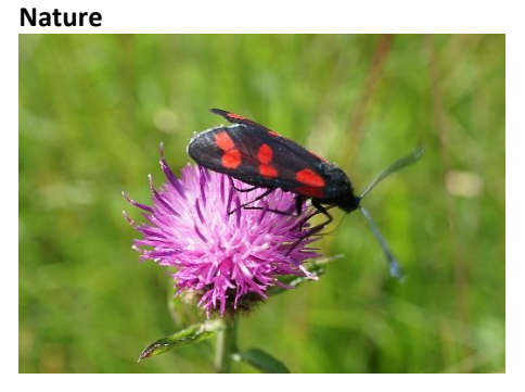
Six-spot burnet moth on knapweed