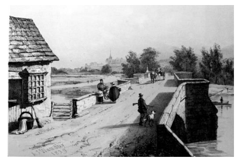
Wilton Bridge by Waudby 1839