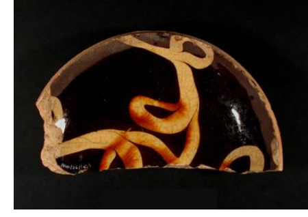
Post-medieval slip-coated pottery