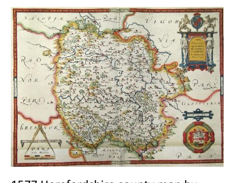
1577 Herefordshire county map by Christopher Saxton