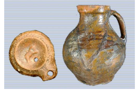
Romano-British lamp and a medieval jug