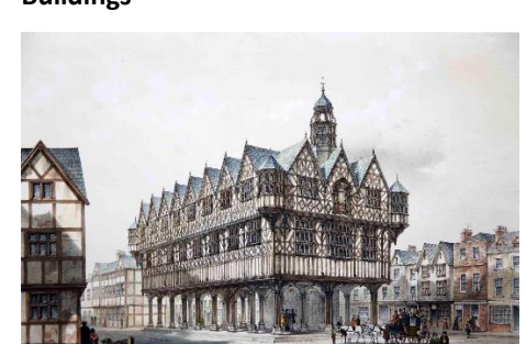
Hereford Market Hall in High Town before its demolition in 1861