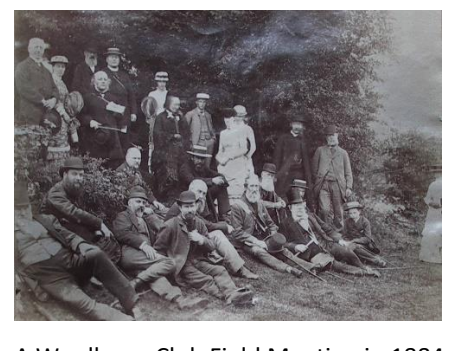
A Woolhope Club Field Meeting in 1884 to Bach Tump and Berrington from an album in the Club library