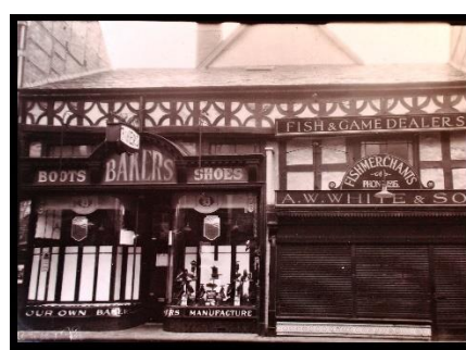
Hereford, no. 9 Eign Street when the RCHME surveyors visited in 1930