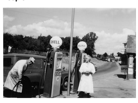
Pencraig Garage run by Tom and Florrie Swallow (Private collection)