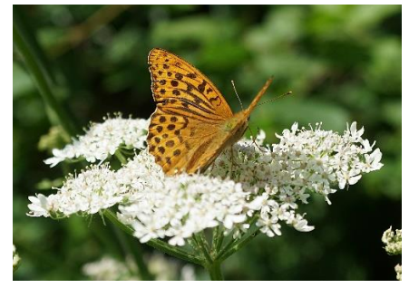
Silver-washed fritillary on hogweed