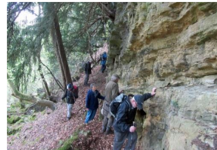
2018 Geology Field Meeting to Huntsham