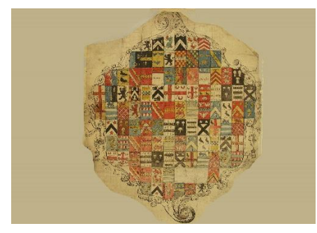
Armorial showing the descent of Simcoe family from the Powells and Gwillyms of Whitchurch. Devon RO