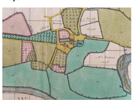
1771 Monnington Court estate map, Woolhope Club library.