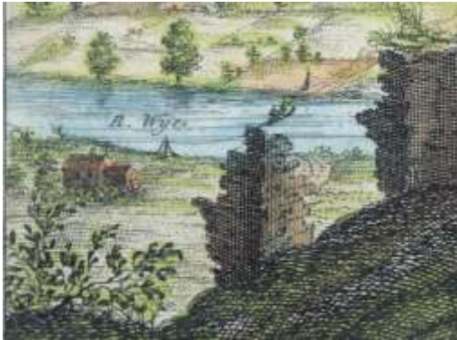
Figure 3. The ferry in the 1731 Buck view