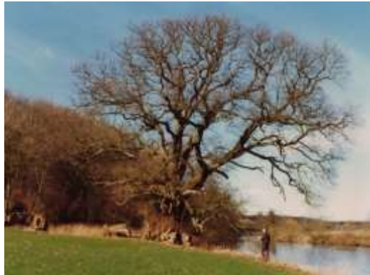
Figure 2. The oak in 1997. (R. Lowe)