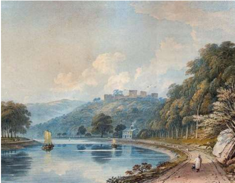
Figure 6. John Varley – approaching Goodrich castle (1833)