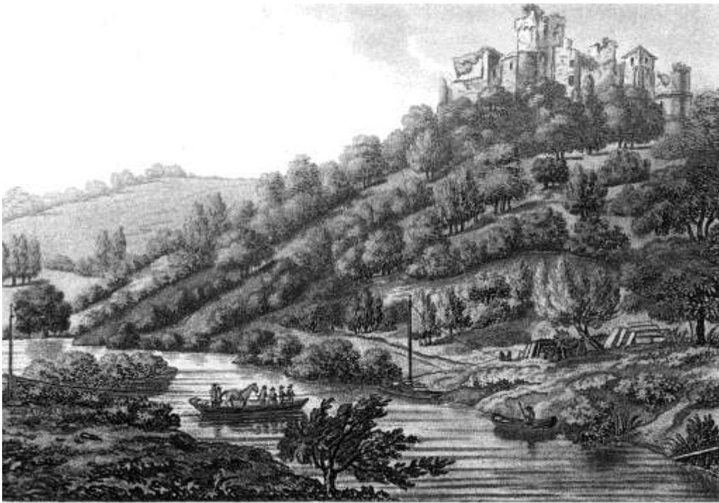
Figure 5. Samuel Ireland's view of the ferry.

Samuel Ireland's 1797 engraving (Fig. 5) shows that the ferry could take animals. The trees below the castle are a bit odd but he does show a large one, perhaps an elm, near the way to the boat. In 1833 John Varley painted a view towards the castle from the river path (Fig. 6) which gives us the best view of the trees near the ferry. His nearer view of the castle (Fig. 7), although the Wye looks like an estuary, does show an apron of land projecting into the river.