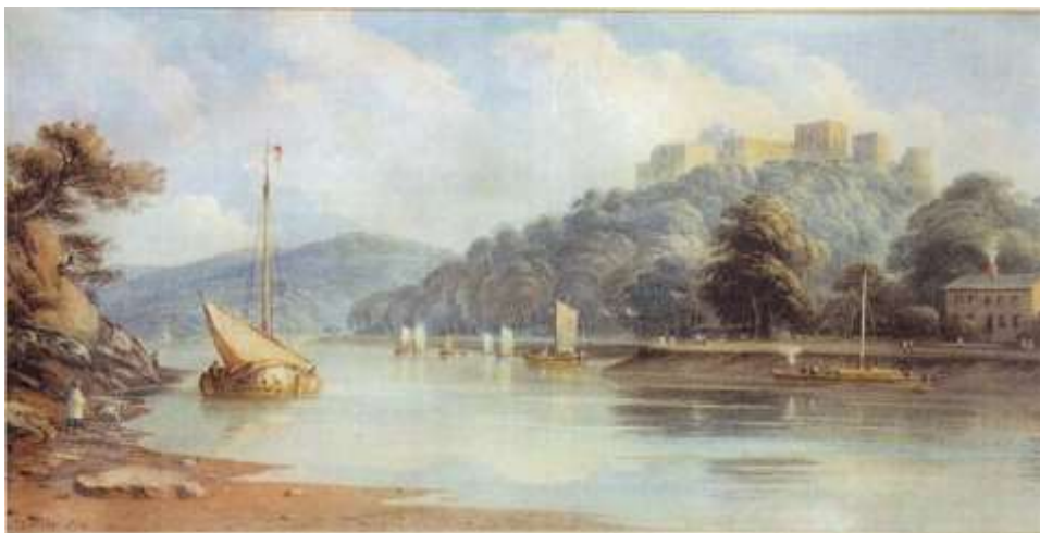
Figure 7. Varley's nearer view of the castle and ferry (1834)