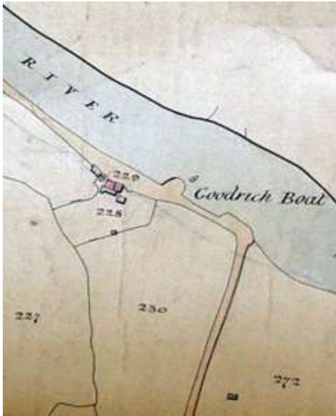
Figure 9. The 1839 Goodrich tithe map with the Boat Inn shown in pink