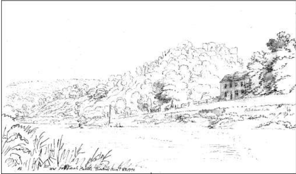
Figure 8. The ferry in 1792

Perhaps Edward Dayes's sketch of 1792, later engraved, gives a better idea of a possible candidate's trunk. (Fig. 8).