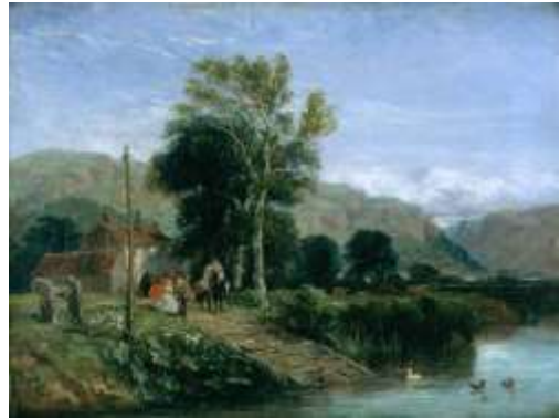
Figure 4. David Cox's view of Huntsham Ferry