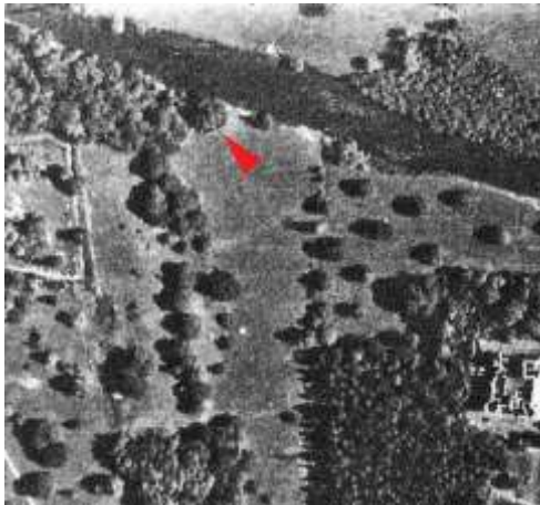
Figure 11. The red arrow points to the ferry oak

An early aerial photo with the ferry oak arrowed is informative (Fig. 11). Between 1839 and 1884, no doubt as part of the boundary alterations after the purchase of the Goodrich Court estate from the Meyricks in 1871 by the Moffatt family, plot 228 on the tithe map has been altered. The tree sits in a notch cut from 228 but there is little sign of the Boat Inn. Remains of a building can be seen in both the 1901 and 1997 photos.