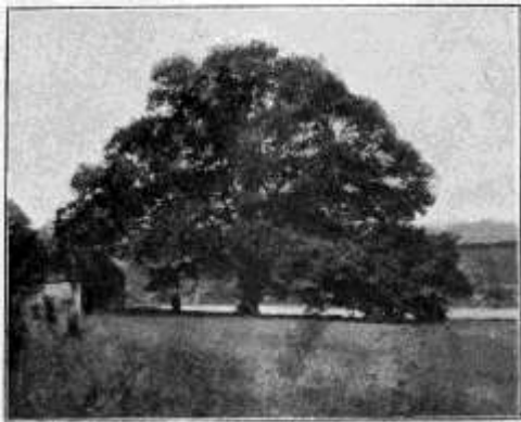
Figure 1. The oak in 1901. (H. C. Moore) 1